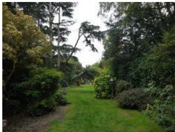
View down the garden

Laburnum, Plane and Larch which suggest that she was undertaking substantial work in the garden. She also ordered a Violet Plum, Greengage Plum, shrubs and vegetable seeds. It is possible that the large cedar, a Deodar, was purchased from Caldwell's. The tree is included in their 1873 General Catalogue with the comment that "Deodar is so well known that it requires little or no comment. It is one of the most graceful trees grown."