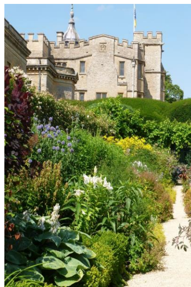
View back to house from herbaceous border

Behind the house is the "Bowling Alley", a large area of lawn, with a ha-ha at one end overlooking the river and a seat by William Kent at each corner (see previous column).