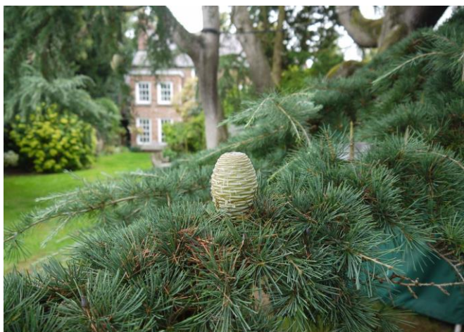
The Deodar cedar