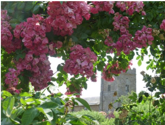
View back to the church from the rose arbour

Back into the herbaceous border and we followed a pergola down to an octagonal pool, surrounded by climbing and rambling roses, and an orchard with some wonderful espaliered apple trees.