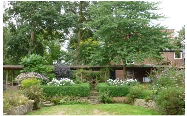
Arts and crafts style garden