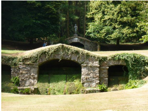
Text and photos Sue Eldridge

bounded by the River Cherwell. Horace Walpole likened it to “Daphne in little, the sweetest little groves, streams, glades, porticos, cascades and river imaginable”. It was lovely walking through the meadow and then wooded areas, mainly beech with laurel throughout as an underplanting, and suddenly coming across Pan, Venus or Apollo at the end of a vista. And throughout, running water in the river, rills, ponds and cascades (below). Arcadia indeed.