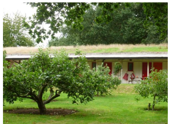
Orchard with eco-chalets beyond

Beyond this is a small orchard with low growing apple trees and the kitchen garden. This is an attractive design with a pond in the middle surrounded by triangular raised beds filled with fruit and veg. There is a fruit cage, a very attractive greenhouse and flowers for cutting, especially dahlias and chrysanthemums. Surrounding the gardens in this area are the Walter Segal eco-chalets, meaning guests need only to step out of their door to be in the midst of the gardens.