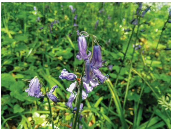
Hyacinthoides non-scripta hybrids (Native bluebell)

Initially a group of about 15 people including avid enthusiasts, university students, ecologists and land surveyors gathered around the course leader, for him to start describing how to differentiate between a Native and Spanish bluebell ( H. non-scripta and H. hispanica ). The leader had brought some Spanish bluebells to display, while there were some Native bluebell hybrids (resembling the native bluebell rather than the Spanish) conveniently placed on the road verge, that must have either originally been fly-tipped nearby or were garden escapees that had crossed with the native population. However, the group leader was keen to emphasise the importance of returning the Spanish bluebells to a plastic container, so as to make sure that none of the material was released into the surrounding environment.