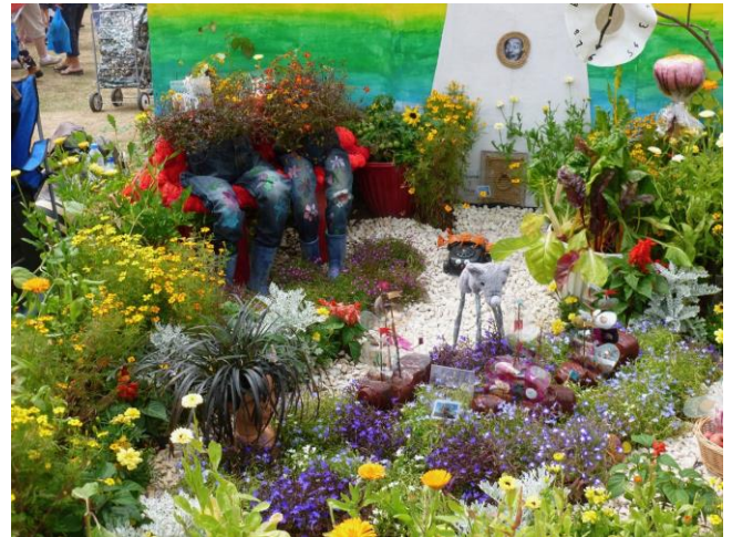
Bruche Primary School entry, inspired by Salvador Dali

health of people and wildlife in mind. The planting was lovely with Buddleja , Verbena and Hydrangea attracting wildlife, but the hard landscaping was stunning.